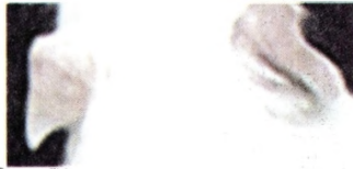
Picture 3: ear appearance 24 hours after croton oil application