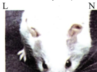
Picture 5: ear appearance 7 days application after hydrocortizone application