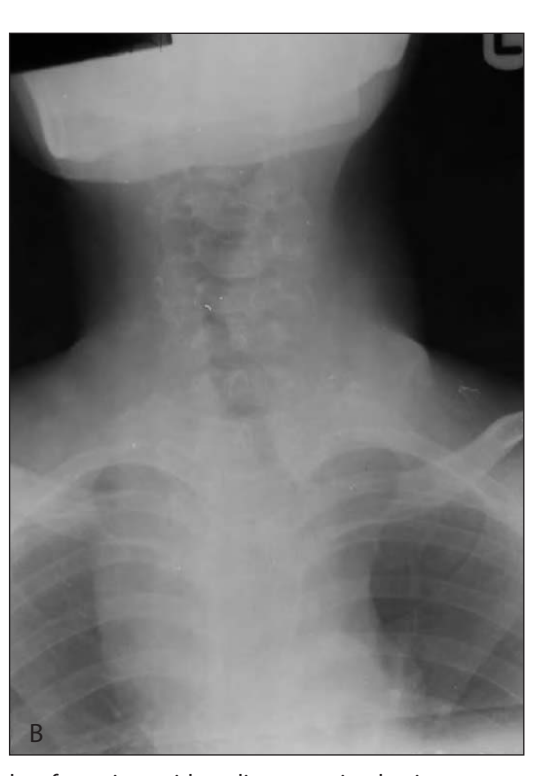
Figure 3 Lateral neck and frontal thoracocervical radiographs of a patient with malignant goitre having retrosternal extension. [A] Showing wide spread nodular calcifications in goitre, cervical osteophytes and erosion of the anterior body of T1 and [B] retrosternal extension with tracheal deviation