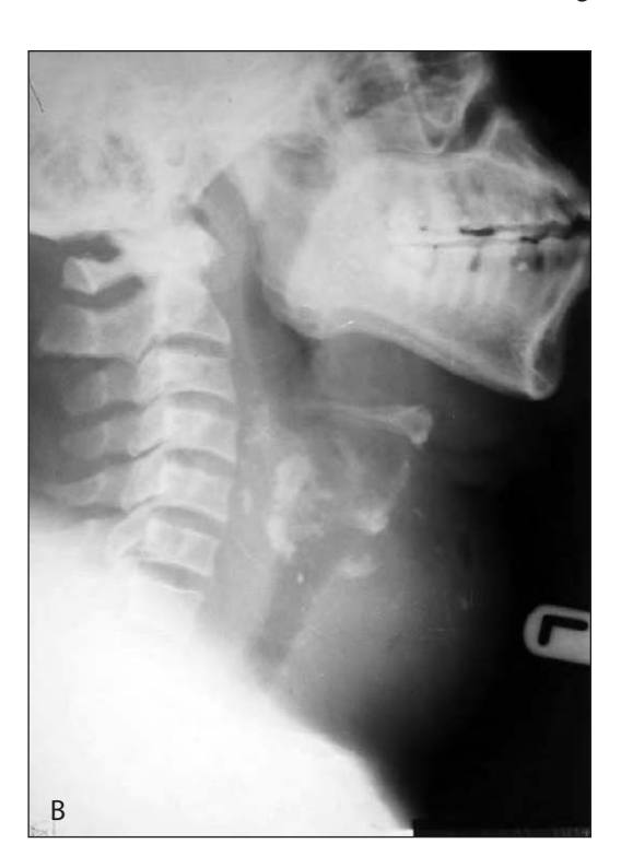
Figure 2 Lateral neck radiographs showing mixed calcifications (nodular and flat). Note tracheal narrowing and air oesophagogram in [A]