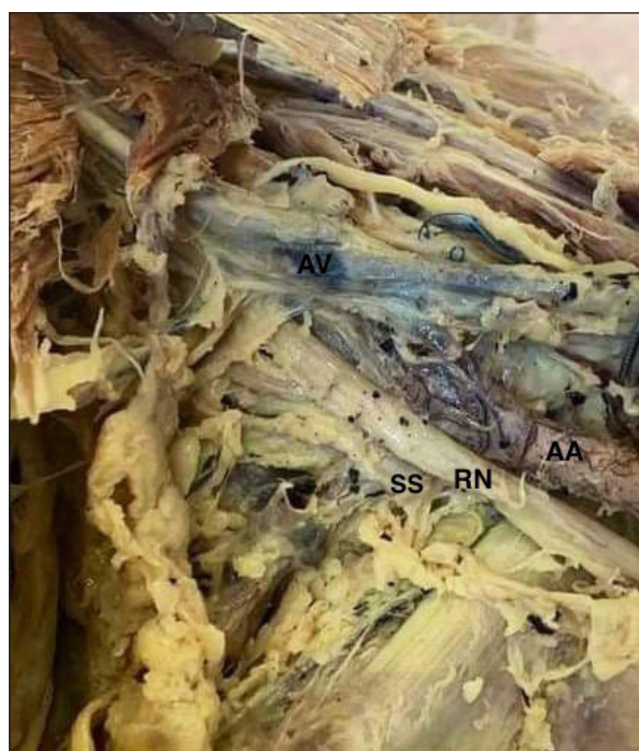
Figure 1. Right axillary region. The right radial nerve compresses the origin of the right subscapular artery from the axillary artery. An area of kinking is detected on the subscapular arterial trunk, corresponding to the point of compression by the radial nerve. AV: Axillary vein, AA: Axillary artery, SS: Subscapular artery, RN: Radial nerve, CSA: circumflex scapular artery, TA: Thoracodorsal artery. Figure 2. Left axillary region. The left radial nerve compresses the origin of the left subscapular artery from the axillary artery. An area of kinking is detected on the subscapular arterial trunk. AV: Axillary vein, AA: Axillary artery, SS: Subscapular artery, RN: Radial nerve.