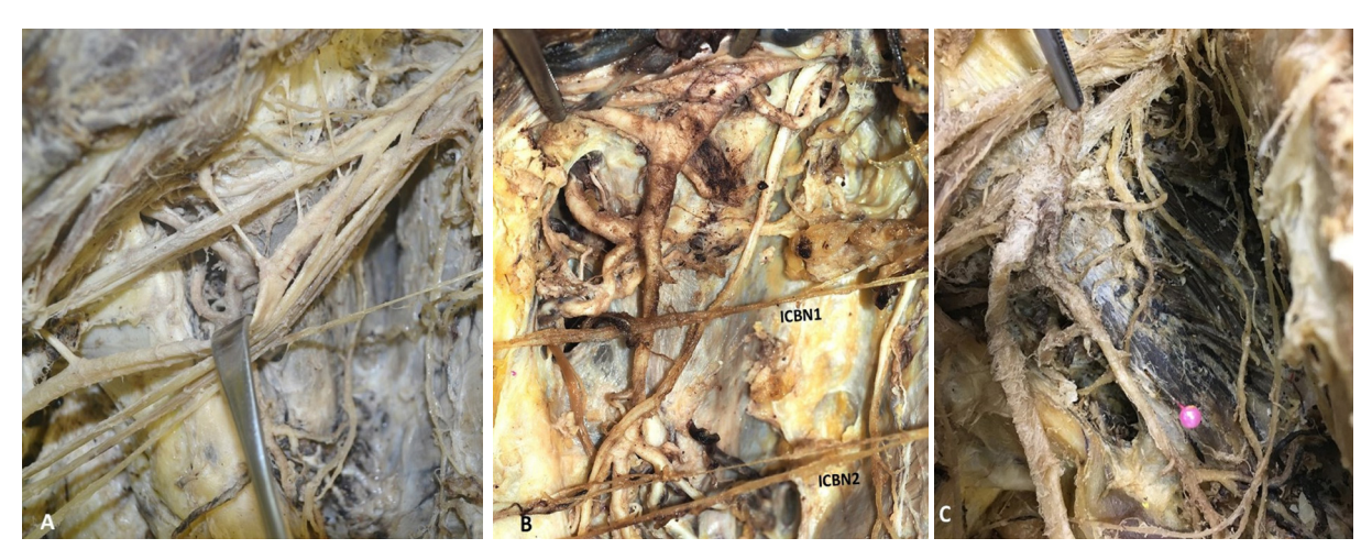
Figure 2. A. Right axilla dissection, B. ICBN-intercostobrachial nerve, C. Dissected area.

ject to environmental or genetic changes, or is directly affected by the brachial plexus development (7). Among the AA branches, the LTA, the SSA and the PCHA have the most variable origin and branching patterns (6). In the present case, two accessory LTAs were identified, thus three LTAs in total supply the lateral thoracic wall. LTA may variably originate from the thoracoacromial trunk (67.2%), less frequently from the AA, SSA and TDA (6), and more rarely from the SSA-PCHA common trunk (8). A high LTA origin (28.9%) (2), subscapular (4.2%) (6) and a low, from the deep brachial artery, origin, have also been described (9). Surgeons should be aware of the LTA variants, since the artery must remain intact during axilla reconstruction. The SSA may originate from the 3rd part (47.2-94.1%), the 2<sup>nd</sup> part (1.66-52.8%) and the 1<sup>st</sup> part (0.6%) of the AA. It also may create a common trunk with the PCHA (3.8-20%), the LTA (10%), and the transverse cervical artery in 6% of cases (10). The PCHA may have a highly variable origin from the AA 3<sup>rd</sup> part (77.1%), from the SSA (12%), from the deep brachial artery (8.4%), and from the LTA (1.2%) (11).