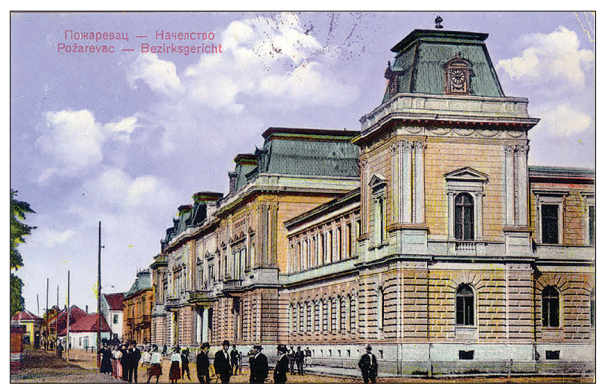
Picture 5. Požarevac at the time when Dr. Jadwiga Olszewska started working there. (The Pozarevac District Town Hall, built between 1888 and 1889.)