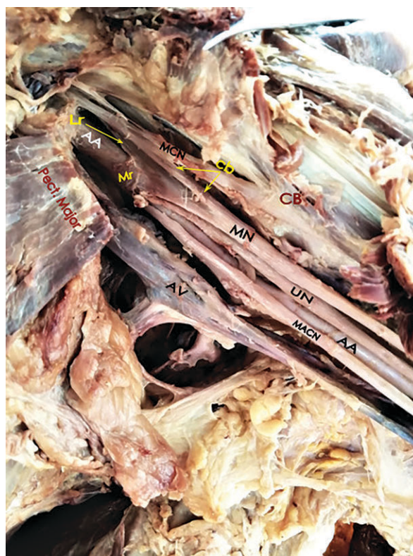
AA=Axillary Artery; AV=Axillary Vein; MN=Median Nerve; MCN=Musculocutaneous Nerve; UN=Ulnar Nerve; MACN=Medial Antebrachial Cutaneous Nerve; Mr=Medial Root; Lr=Lateral Root (arrow); cb=Communicating Branch (double arrow); CB=Coracobrachialis Muscle.

There have been several case reports and studies about anastomotic branches between the median