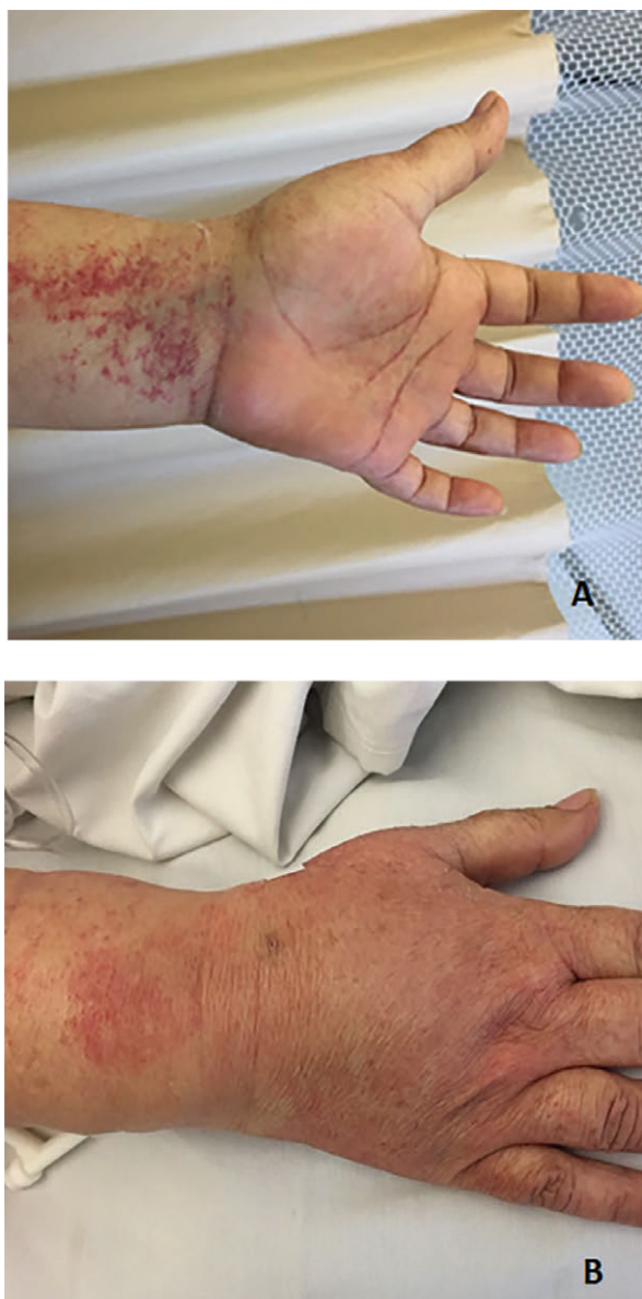
Figure 1. Diffuse ecchymosis in arms (A); Petechia (B).

ing admitted to the Intensive Care Unit, the same symptomatology was reported to persist for 3 more days. She was found to have no febrile antibodies and no antigen reaction to dengue when tested, but was reported positive for anti- Leptospira antibodies, IgM 3.510 Optical Density (OD) and IgG 1.574 OD (Range: Negative 0.0 to 0.3 and Positive >1.0; these antibodies were detected using commercial kits (Diagnostic automation, INC. Cat # 8204-3 and Cat # 8208-3 respectively). She was treated