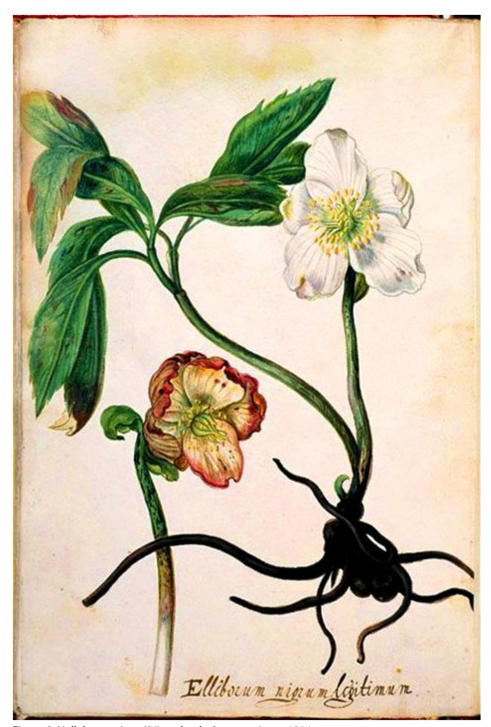
Figure 2. Helleborus niger, Kräuterbuch, Actaea spicata, 1914.

species in Greek antiquity, less irritating than the " Helleborus niger " noted by Paracelsus, or it was perhaps used in poultices, or after some process which could have altered