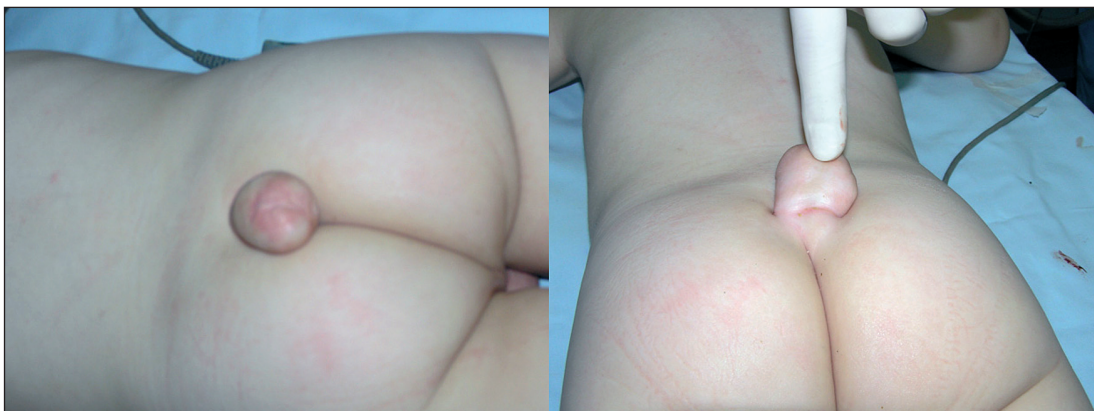
Figure 1. B Subcutaneous lipoma and a cutaneous hemangioma are shown.

and urogenital malformations, albeit rarely. Deterioration of urinary bladder function is common in patients harboring lipomyelomeningocele. The detection of bladder anomalies appears to correlate with the age at which a child is examined and the sensitivity of means by which the patient is evaluated (15, 16).