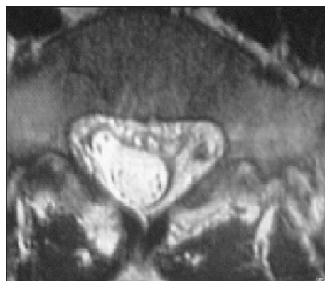
Figure 3. MRI lumbosacral region with spina bifida occulta associated with intradural and extraspinal lipoma