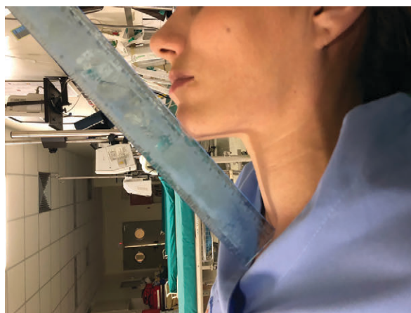
Figure 1. Sternomental Distance in Neutral Head Position.

All patients fasted preoperatively, as per the European Society of Anaesthesiology (ESA) guidelines (13). Standard monitoring, including ECG, SpO 2 and NIBP, was applied to all patients, and an 18G intravenous cannula was inserted. Muscle relaxation was assessed with train-of-four (TOF) monitoring using a peripheral nerve stimulator (Innervator 252, Fisher & Paykel Electronics Ltd, Auckland, New Zealand) placed in the ulnar nerve. Premedication with intravenous midazolam 1-2 mg was administered to all patients. Preoxygenation was performed with 100% O 2 via face